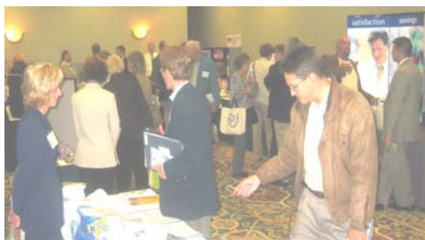
Conference attendees visit exhibitors.